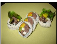
BUL-GO-GI ROLL 12 broiled thin sliced rib eye, cucumber, asparagus, carrot, lettuce, & oshinko w/ special sauce (5 pcs)