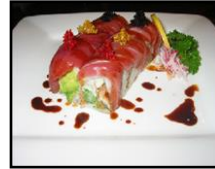
COLLEGEVILLE ROLL 15 (i) eel, avocado, cucumber, & crab stick (o) tuna, eel sauce, scallion, & tobiko