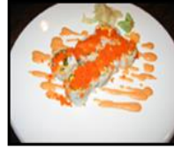
CHICKEN TEMPURA ROLL 10 (i) chicken tempura & lettuce (o) spicy mayo & masago