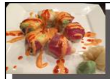
DREW'S THURSDAY ROLL 15 (i) tuna, white tuna & cucumber (o) tuna, white tuna, avocado, spicy mayo & chili sauce