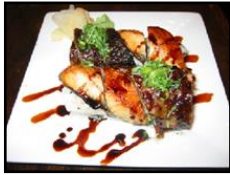
ALLIGATOR ROLL 13 (i) smoked salmon & cucumber (o) eel, salmon skin, eel sauce & scallion

🍷 - gluten free option available | 🌱 - vegetarian option available | 🔥 - spicy | (i) - inside (o) - outside