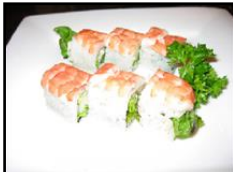
BOSTON ROLL 11 (i) asparagus, cucumber & lettuce (o) cooked shrimp & Japanese mayonnaise