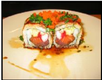
BONJUNG DRAGON ROLL 15 (i) tuna, salmon, crunch, avocado, cucumber & crab stick (o) eel, scallion, eel sauce, & smelt roe (4 pcs)