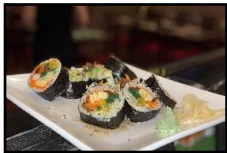
BONJUNG GIMBAP 7.5 Korean style vegetable roll with egg