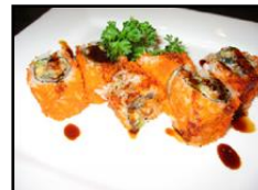
EEL TEMPURA ROLL 11 (i) eel tempura & avocado (o) eel sauce & masago